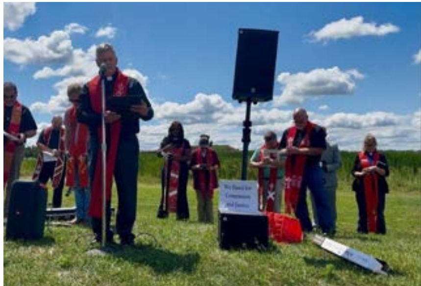
Photo caption: Indiana UMC clergy lead a prayer vigil outside of the Miami Correctional Facility.