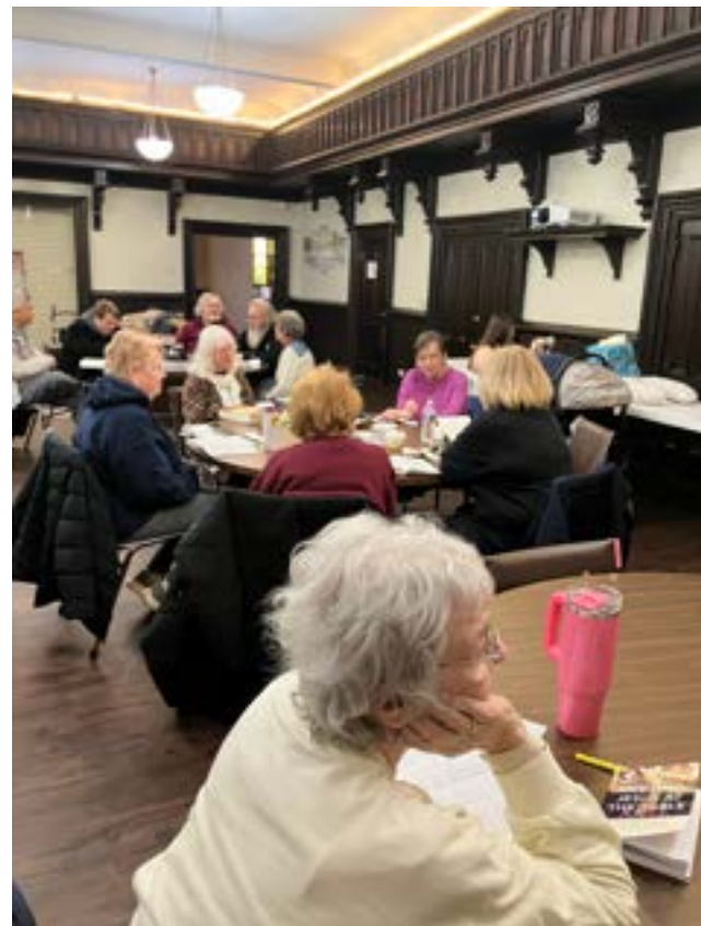
Photo caption: Participants of Trinity's Spiritual Friends small group gather in the Great Room during Lent for study and discussion.